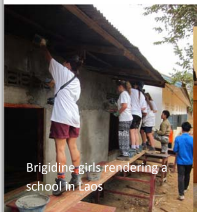
Brigidine girls rendering a school in Laos

Year 8 launched their charity, St Vincent de Paul Winter clothing appeal. Year 12 launched their charity, Manly Women's Shelter, during a recent assembly. The Justice and Democracy Club held a lunch time fundraiser for the Nepal earthquake disaster relief raising over $1000 in one lunch time. Monies raised went to Caritas.