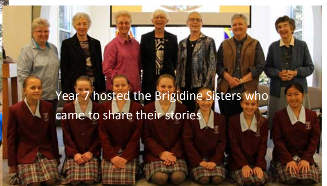
Year 7 hosted the Brigidine Sisters who came to share their stories